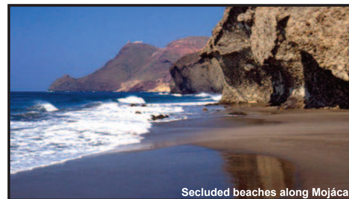
Secluded beaches along Mojácar

The campsite is a quiet and peaceful area, and we strictly enforce noise limits at night to ensure the peace of our residents.